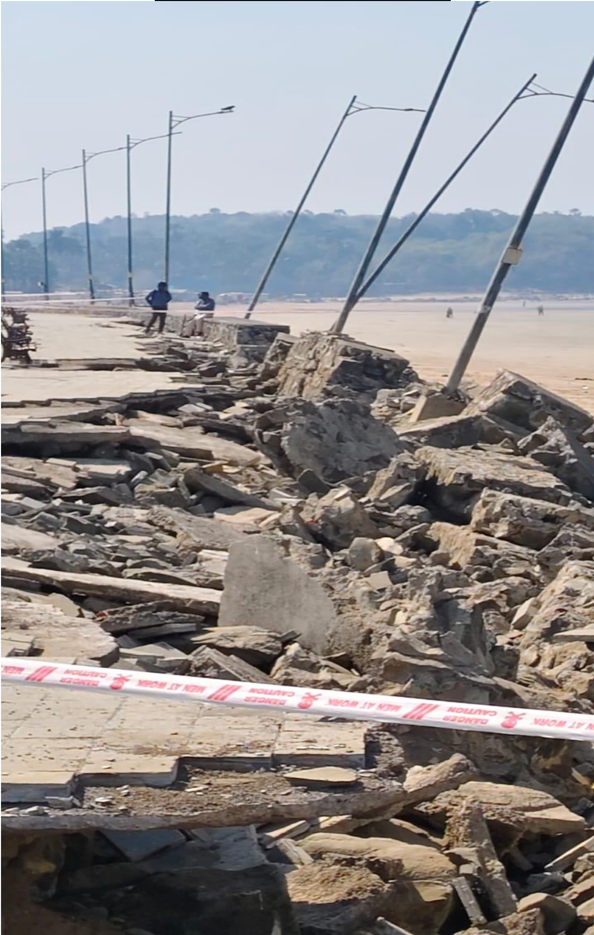
PROVIDING ANTI-SEA EROSION MEASURES AND BEAUTIFICATION AT AKSA BEACH, MADH, MUMBAI SUBURBAN (PHOTOGRAPHS AFTER DAMAGES OCCURS)